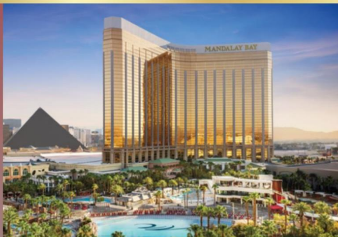
MANDALAY BAY CONVENTION CENTER

For more information, visit www.iacs-nas-meeting.org or scan the QR code